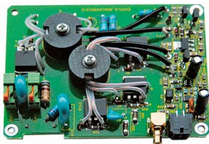
Fig. 1. External view of PCD-N-2 driver