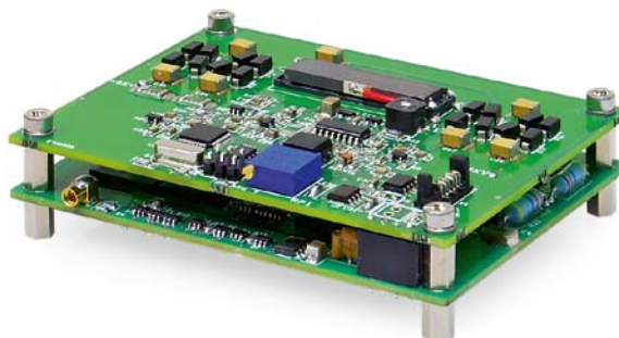
Fig. 2. External view of PCD-N-3x driver