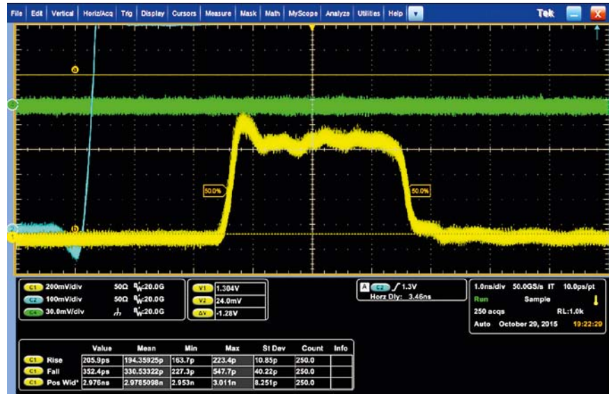
Fig 2. Example of temporal pulse shape, stability of pulse shape